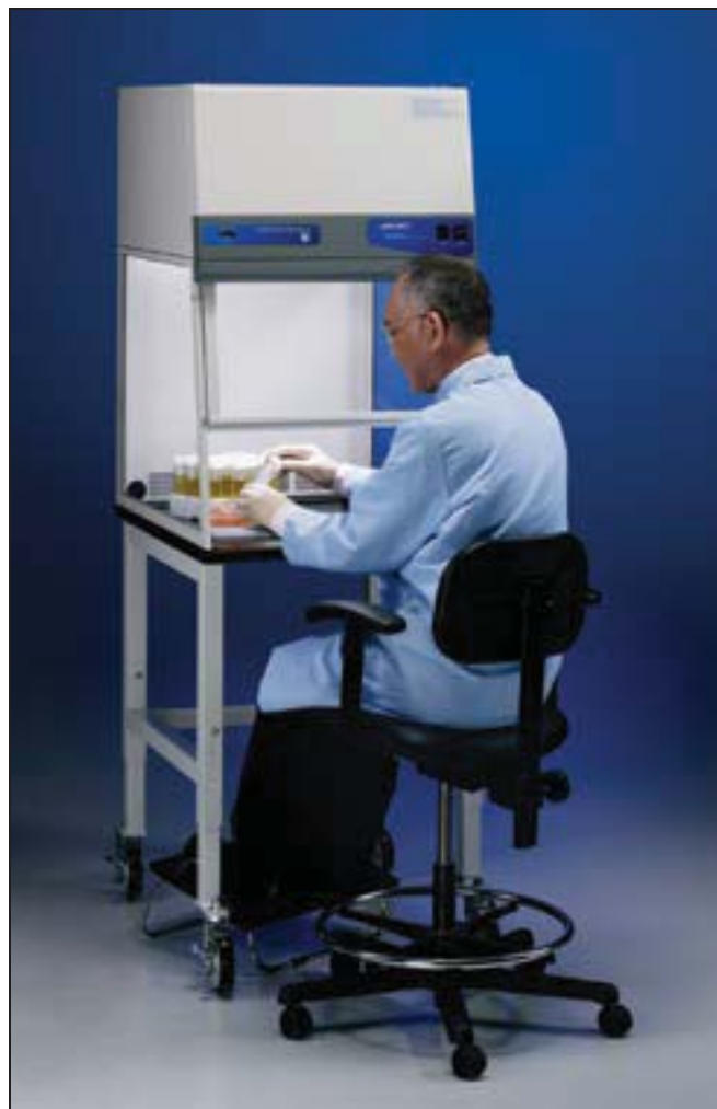
Purifier Vertical Clean Bench 3970200 on Solid Epoxy Dished Work Surface 3909900 and Telescoping Base Stand 3746710 with Ergonomic Chair 3744000 and Adjustable Footrest 3746000.

Purifier Vertical Clean Benches are offered in 2', 3' and 4' widths. Built-in options include a UV light with timer for secondary decontamination and a Guardian Airflow Monitor to monitor downflow velocity and HEPA filter loading.