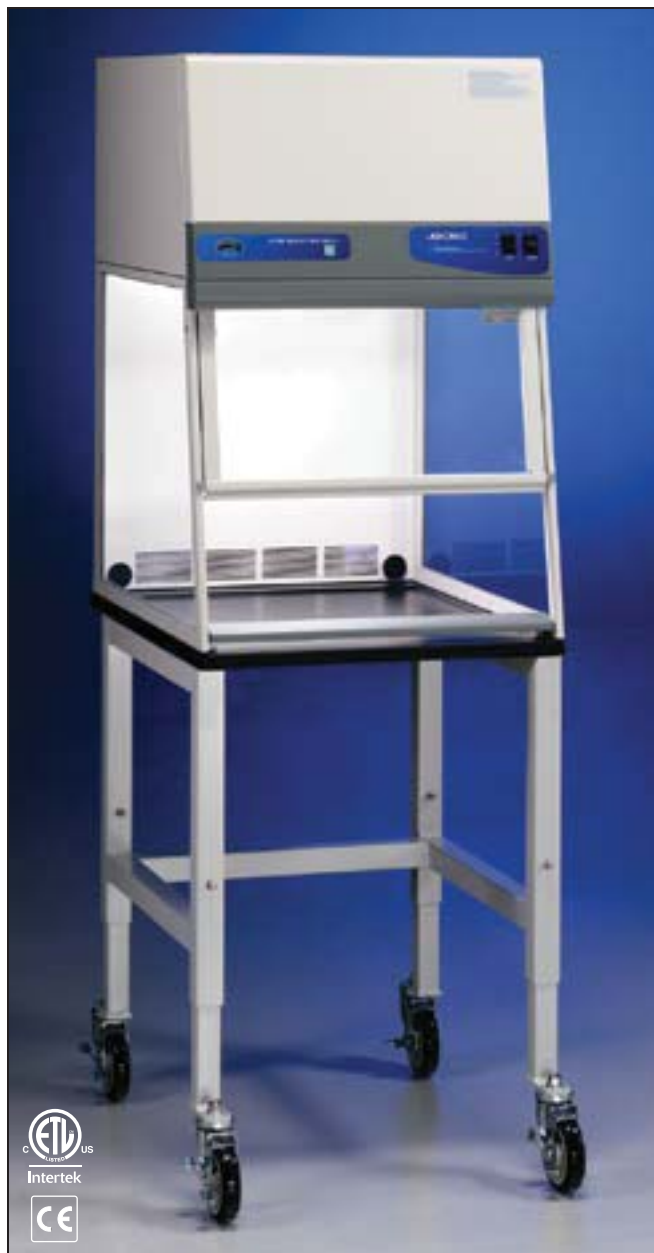
Purifier Vertical Clean Bench 3970200 on Solid Epoxy Dished Work Surface 3909900 and Telescoping Base Stand 3746710.