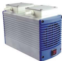
Vacuum Pump Cat. No: 18200745