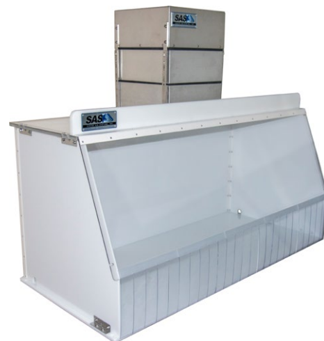
50" High Efficiency Ductless Fume Hood

Please note that the high-efficiency ductless fume hoods are compliant for nonsterile HD compounding only and not for sterile preparations.