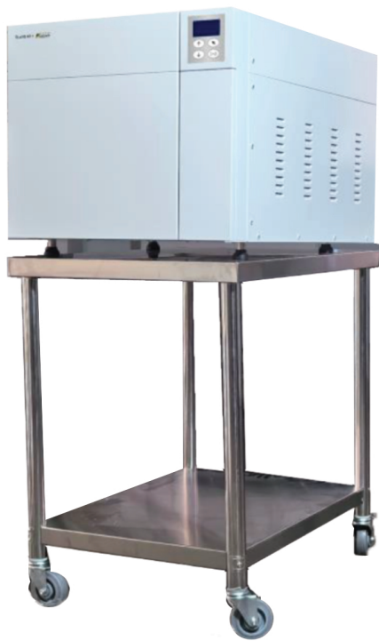
Trolley Included with Each Unit