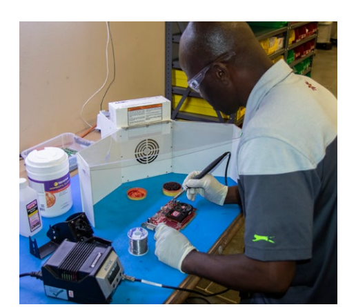
The Winged Sentry with lid helps protects the operator from harmful soldering fumes.