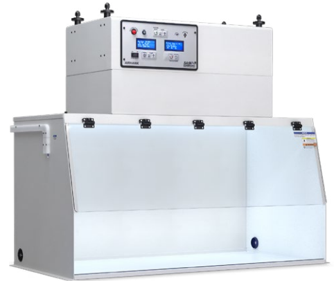
46" AirHawk Ductless Fume Hood

Typical applications for the AirHawk include chemical fumes, pharmaceutical compounding, soldering, light dust removal, biological, solvent or epoxy use, and many more applications that require the removal of fumes and particulate. Upgrade your respiratory protection to the AirHawk and experience an improved workflow with the automatic features and beneficial user configurations.