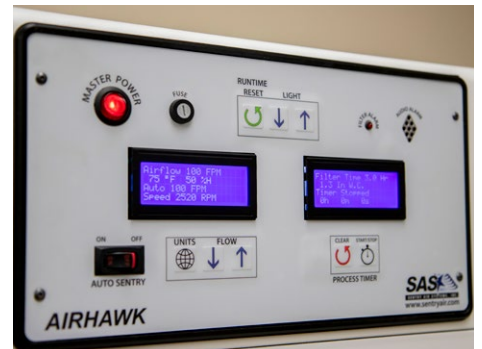
AirHawk's Advanced Control Panel