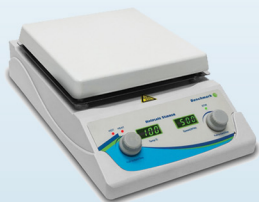
H3770 7 x 7 Inch Series