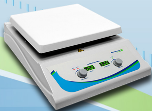
H3710 10 x 10 Inch Series