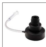
A00000135 Sensor check