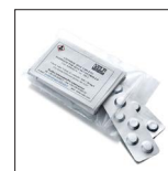
A00000136 Control Test tablets