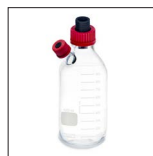
A00000410 Denitrification glass bottle