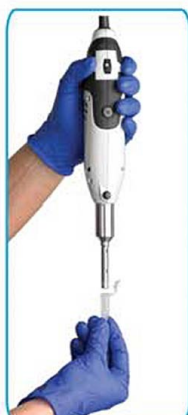
Ergonomic, "Slim-line" handle design