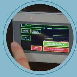
Table top unit with 4 tray dryer, large interior capacity, up to 7 liters of material per batch.