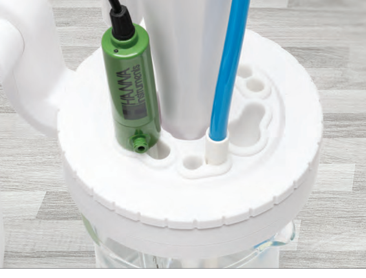
The electrode holder is easy to flip to gain added height.

For a more compact design, the electrode holder is mounted directly onto the titrator body. The press-to-release button makes for simple height control. Need to save more space? Just reverse the holder to accommodate larger beakers.