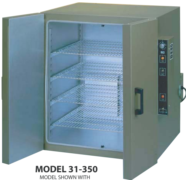
MODEL 31-350 MODEL SHOWN WITH TWO OPTIONAL SHELVES

7 AND 10 FT 3 300°F (150°C) 450°F (235°C) 550°F (288°C)