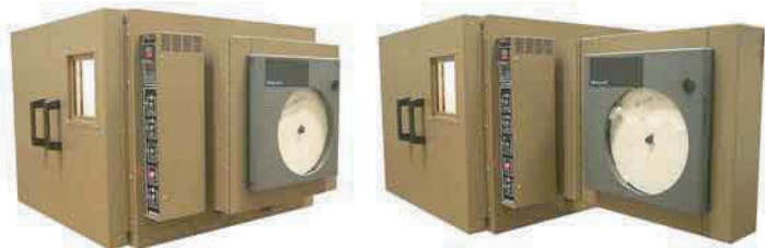
MODEL 21-350ER shown with optional window and chamber light & 10" "swing-out" circular chart recorder