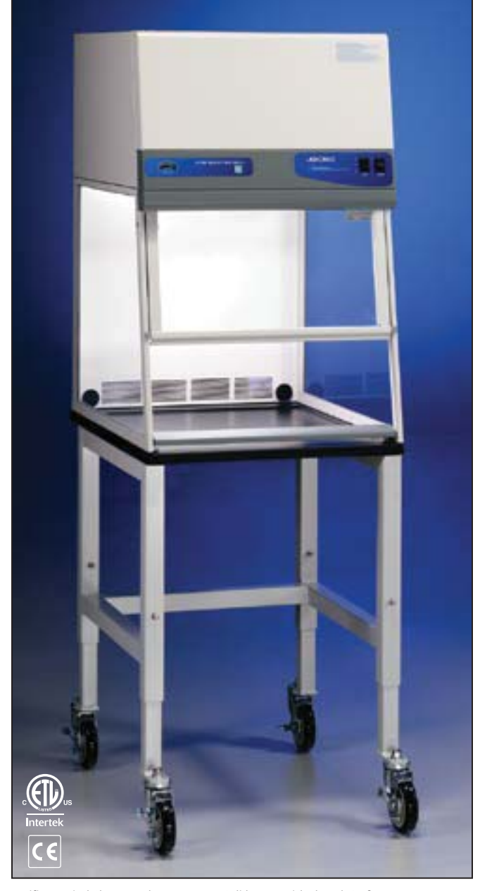
Purifier Vertical Clean Bench 3970200 on Solid Epoxy Dished Work Surface 3909900 and Telescoping Base Stand 3746710.