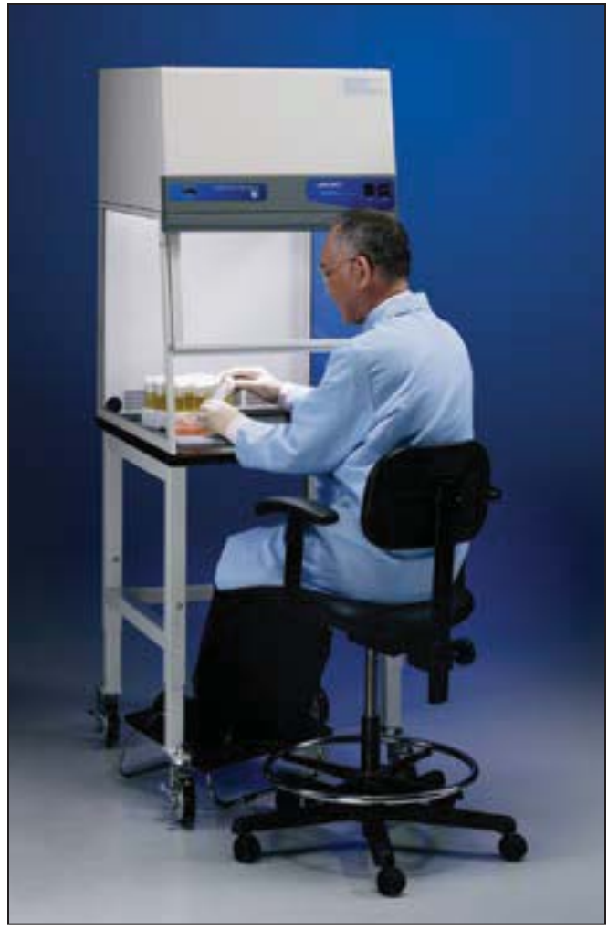
Purifier Vertical Clean Bench 3970200 on Solid Epoxy Dished Work Surface 3909900 and Telescoping Base Stand 3746710 with Ergonomic Chair 3744000 and Adjustable Footrest 3746000.

During operation, room air is drawn through a prefilter in the top of the cabinet to trap large particles. Then, the air flows through a 99.99% efficient HEPA filter and is projected vertically over the work area. This HEPA-filtered air prevents contaminants from entering the work area and provides a particulate-free work environment that minimizes cross contamination.