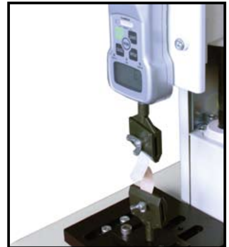
Stand with Optional Grip Performing Peel Test