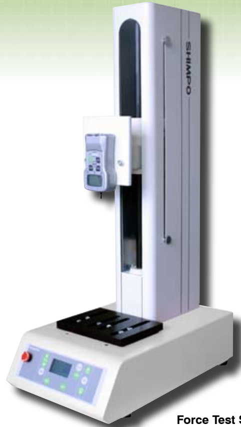
Force Test Stand shown with Force Gauge (Sold Separately)