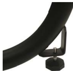
Additional pole-support foot