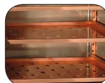
copper shelving option

170 Shields Court Unit 2 Markham, ON L3R 9T5 TEL: (905) 475-5880 ext. 226 FAX: (905) 475-1231