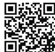
more information copper shelving