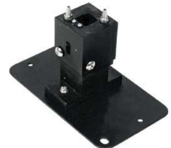
Cat. No. 18900335 10mm water-jacketed 1 cell holder (for SP-V1100 & SP-UV1100)