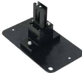
Cat. No. 18900339 solid sample holder (ø1.5-3mmø 1 position)