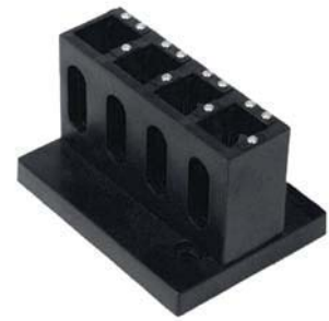
Cat. No. 18900331 4-cell holder for 10mm sq. cuvette