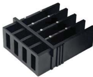
Cat. No. 18900333 4-cell holder for up to 100mm sq. cuvette