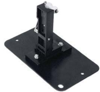
Cat. No. 18900338 Test tube holder(ø8-ø22mm)