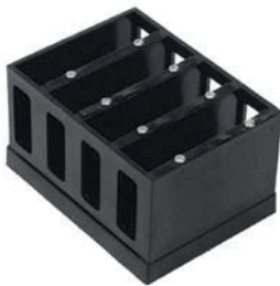
Cat. No. 18900332 4-cell holder for 10mm to 50mm sq. cuvette