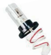
Cat. No. 18900342 Milas deuterium lamp, 10V, 300mA, 30W (for SP-UV1000&SP-UV1100)