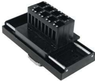
Cat. No. 18900340 8-position auto cell changer (for SP-V1100&SP-UV1100)