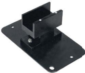
Cat. No. 18900334 cylindrical cell holder(ø16mm)