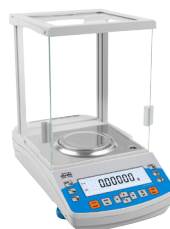
AS R1 PLUS, d = 0.1 mg AS R2 PLUS, d = 0.1 mg