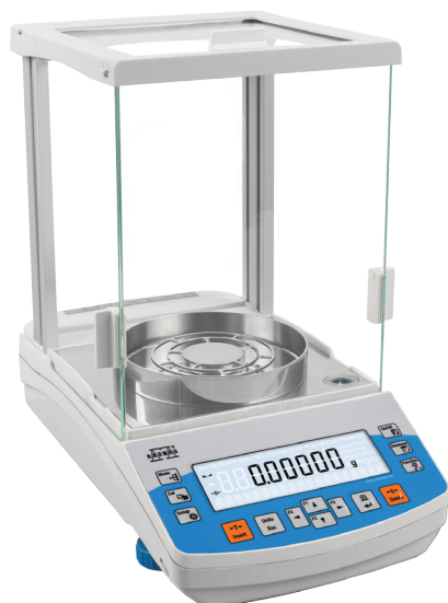
AS R2 PLUS, d = 0.01 mg

Innovative design and system solutions for standard-class products