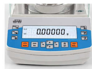
Large LCD display with text information section